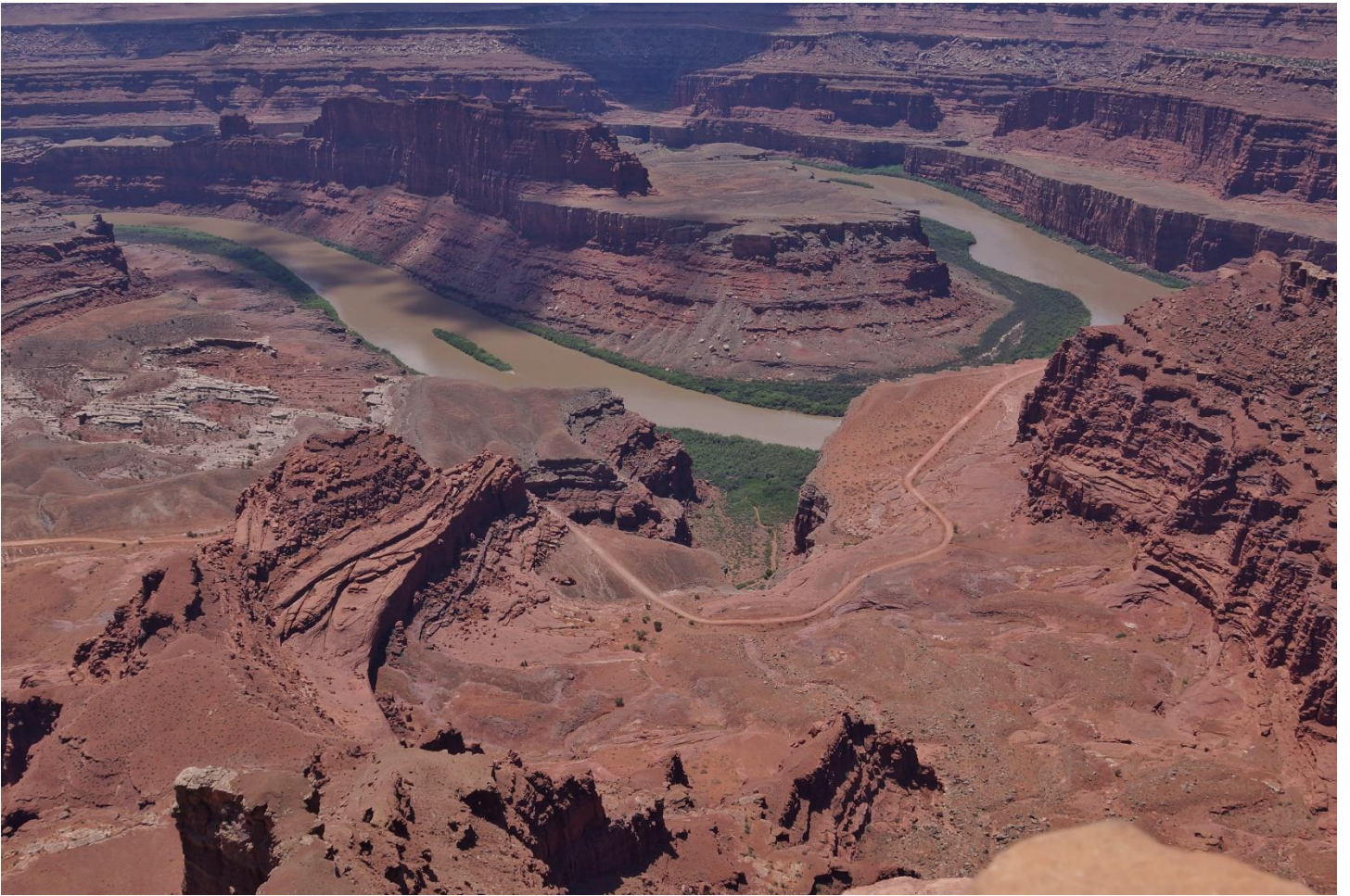
View from a lower ledge showing the road we drove to the Gooseneck and Shafer Basin.