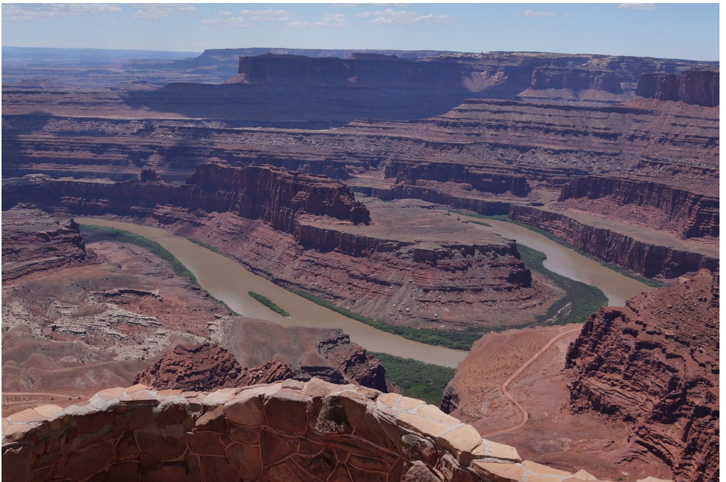
View from the highest point which is Dead Horse Point.