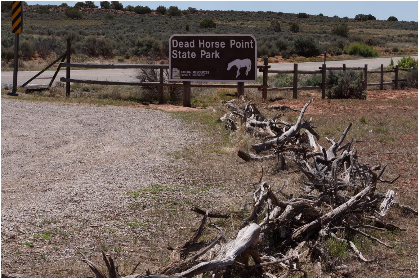
The entrance into the Dead Horse Point State Park.