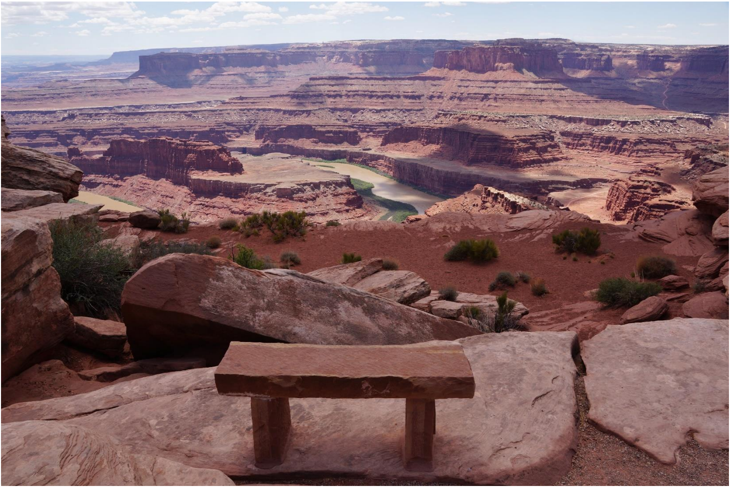
What a great view! This is on the upper ledge and the lower ledge is just below.