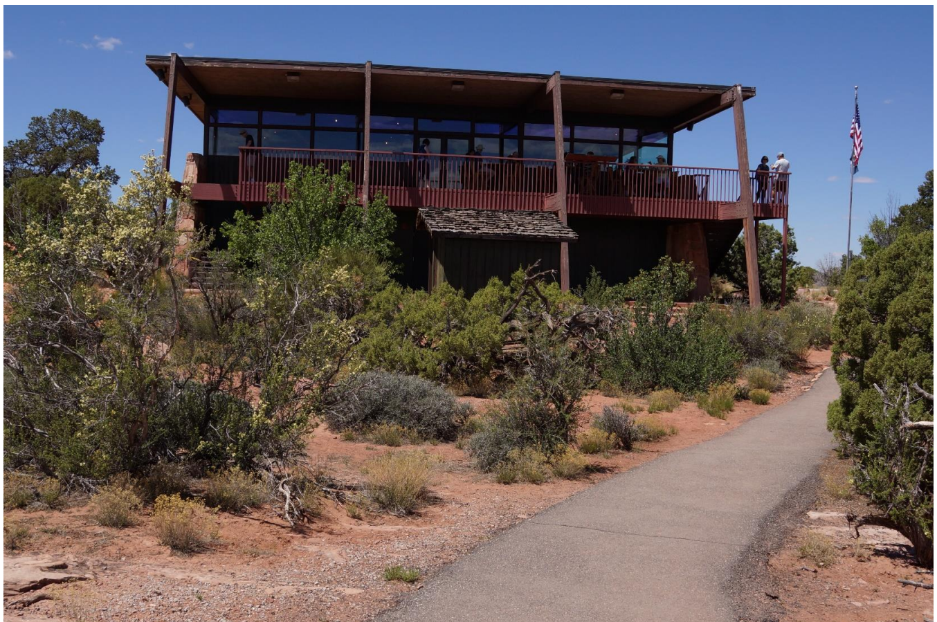
The Visitor Center.