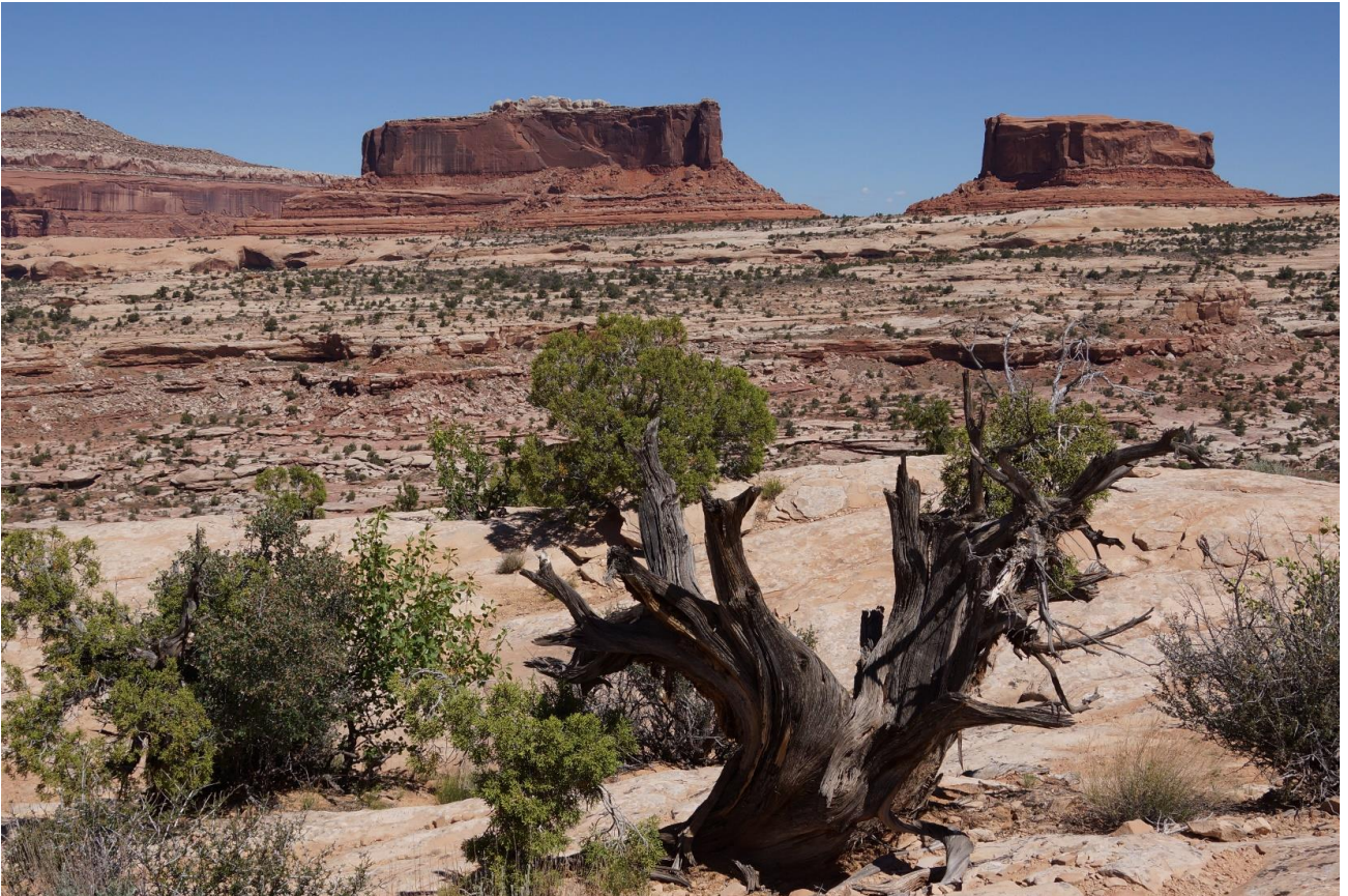
The Monitor and the Merrimac Mesa's near the entrance of the state park.