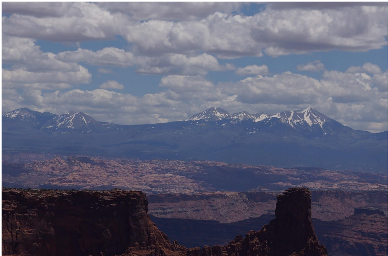
View to the east of the LaSal Mountains.