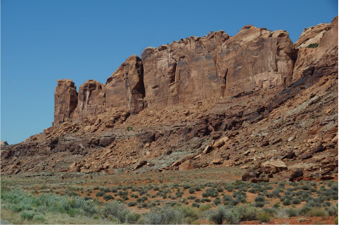
On the road going to the state park from Moab.