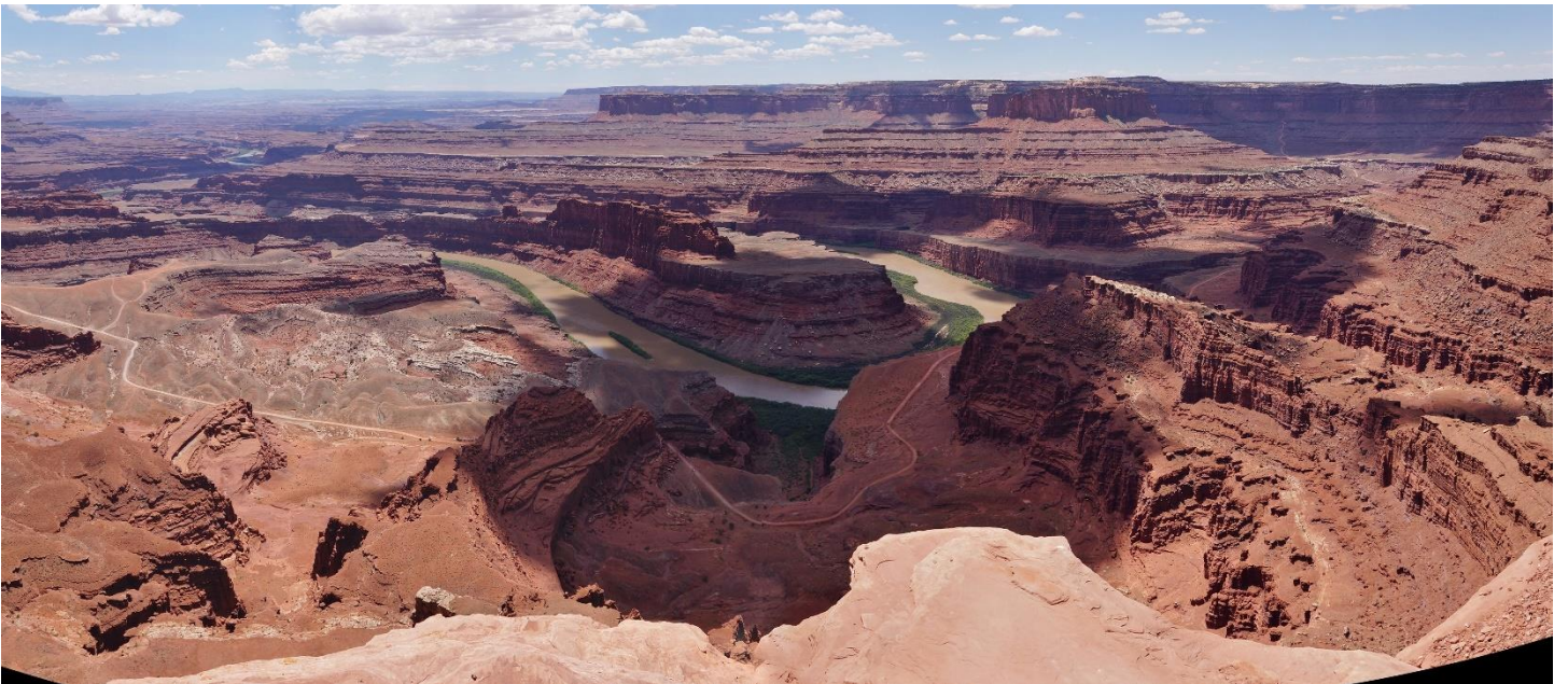
Panoramic from the lower ledge.