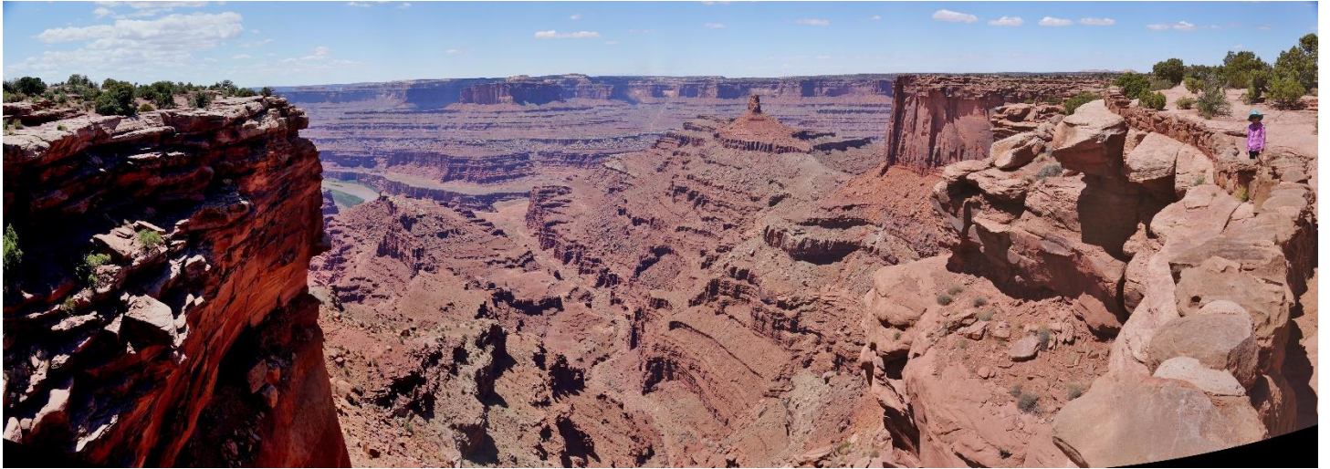
Panoramic from near the Visitor Center.