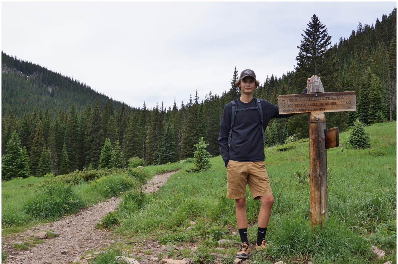
But the best hiking was the next day on the 10 mile roundtrip hike on South Boulder Creek Trail to Rogers Pass from Moffat Tunnel.