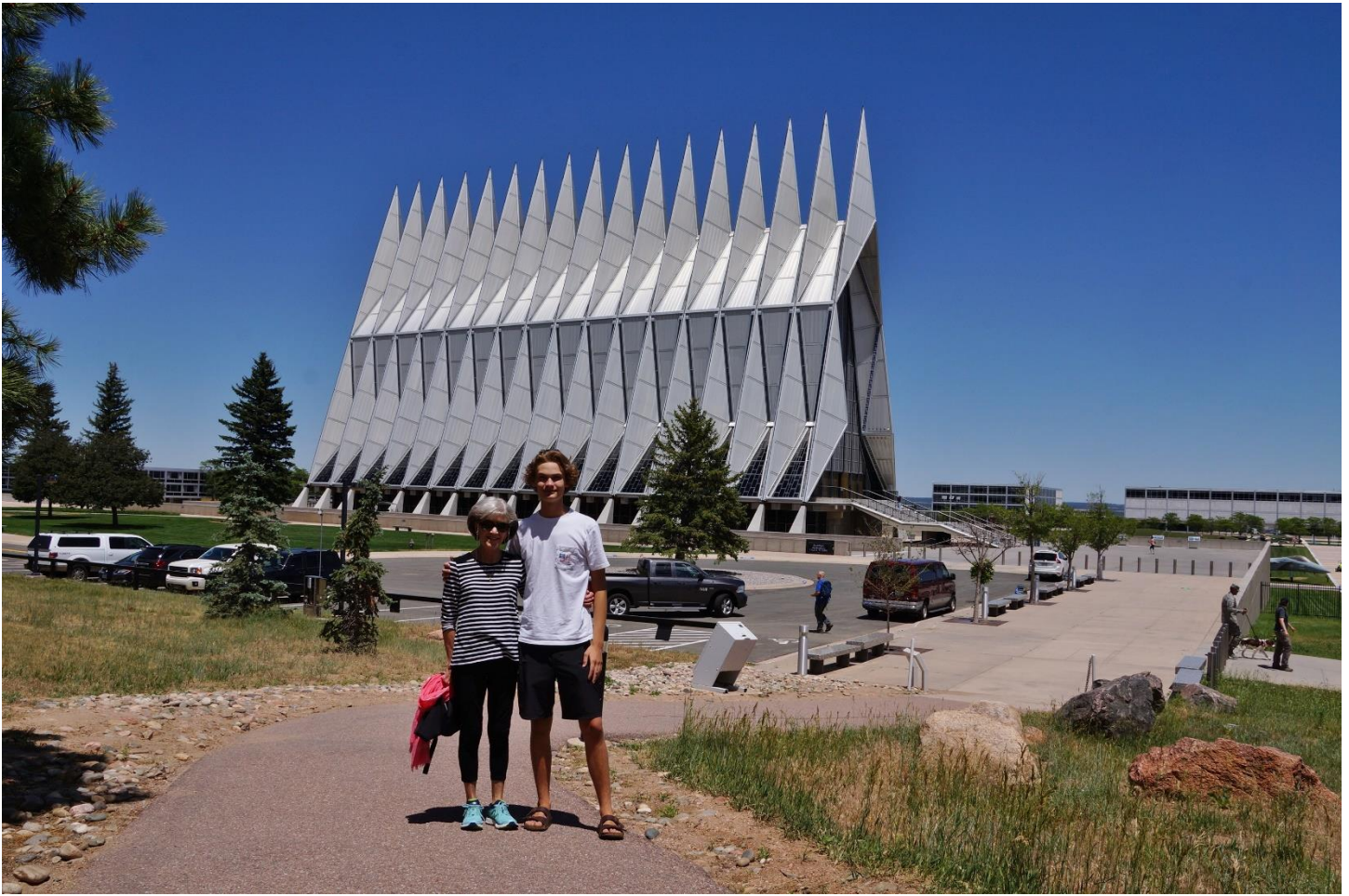
The next day we visited the Air Force Academy.