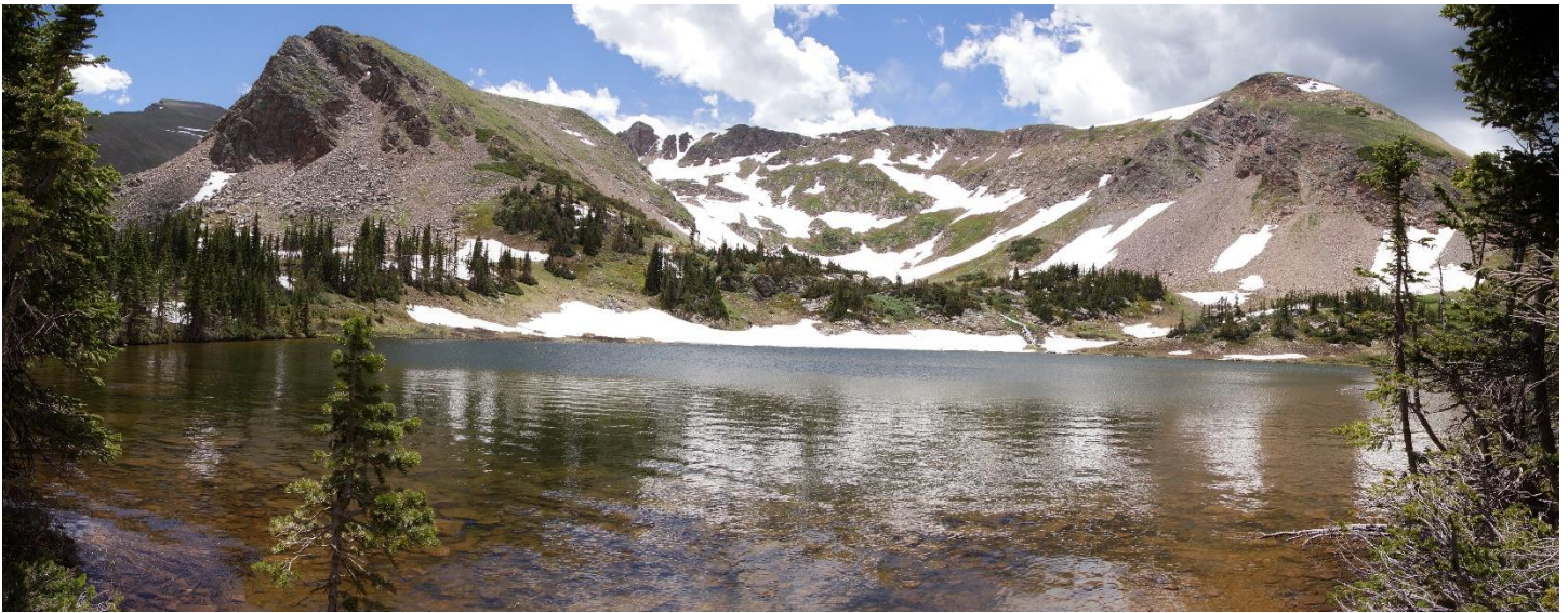
And Rogers Peak Lake was full of trout.