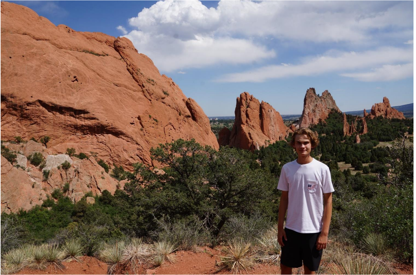
Nearby was Garden of the Gods with superb hiking.