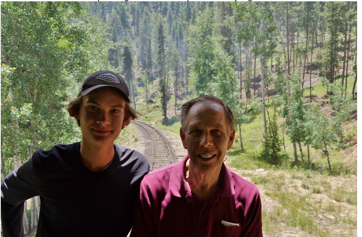
Our great day ends as we head for home.