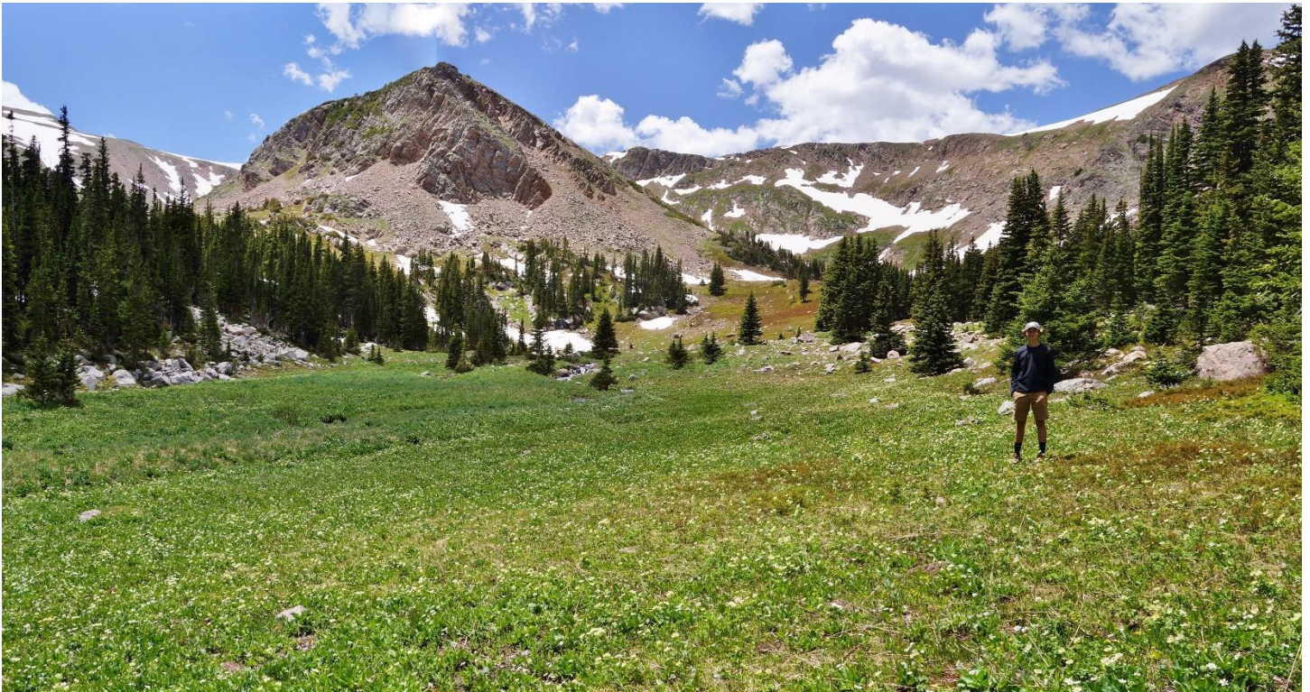
We saw vast fields of Meadow Marigold wildflowers.