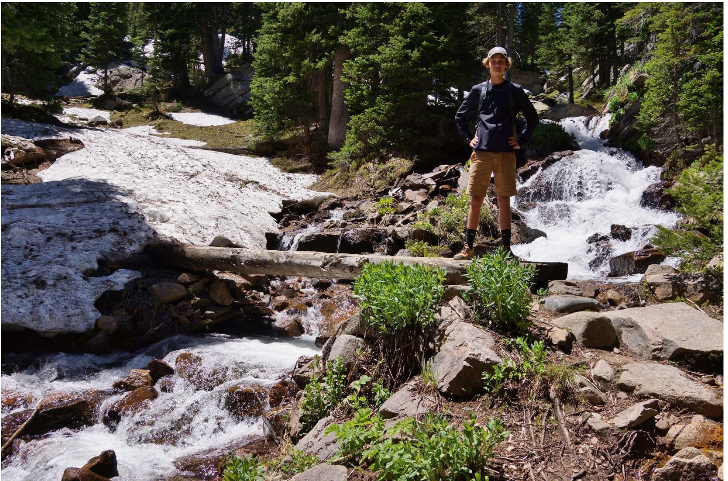
We crossed many roaring creeks.