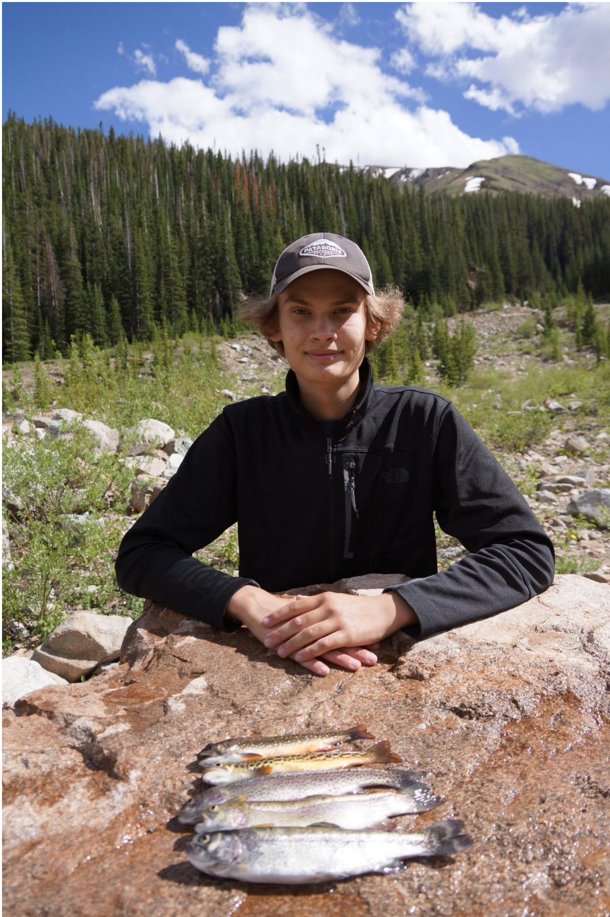
We kept 5 for dinner and threw back as many.