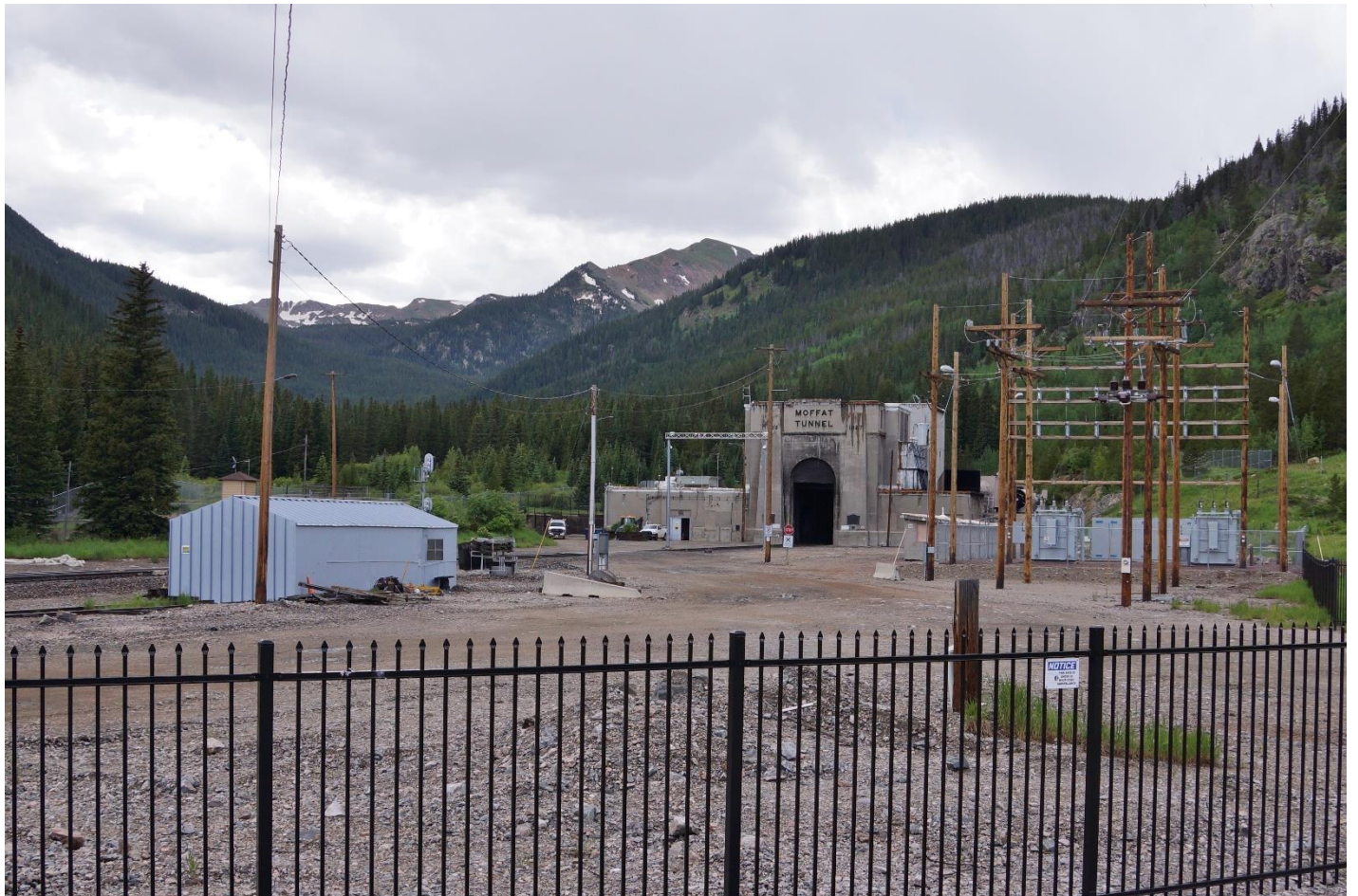
After a brief snowstorm and 10 miles with 1,756' of elevation change we arrive back at the trailhead—The Moffat Tunnel.