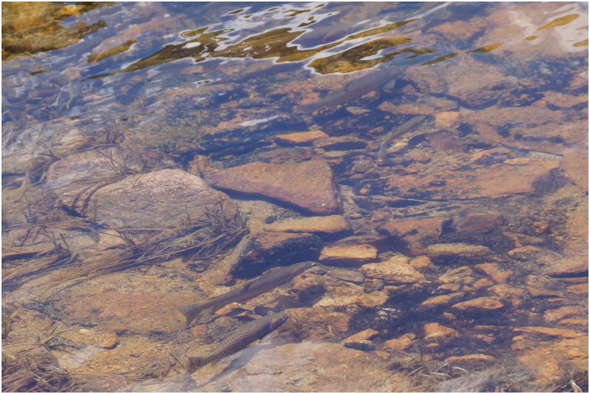
There are 5 trout in this photo.