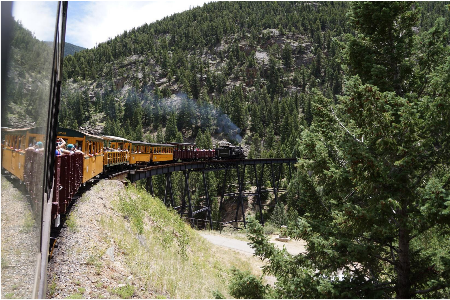
The next day we take a train ride to the Everett Silver Mine near Georgetown.