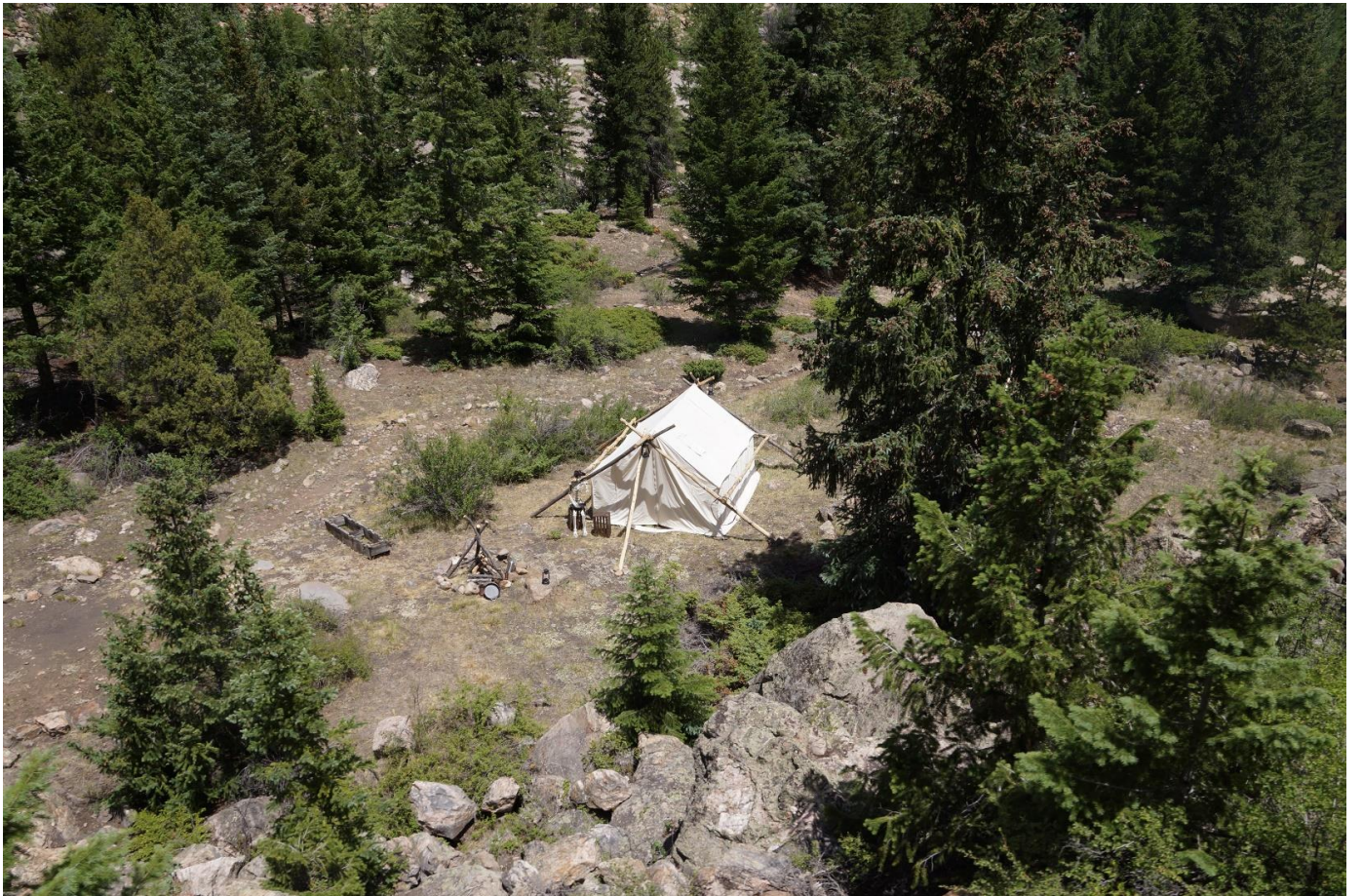
We pass a gold miner's camp inhabited by a ghost.