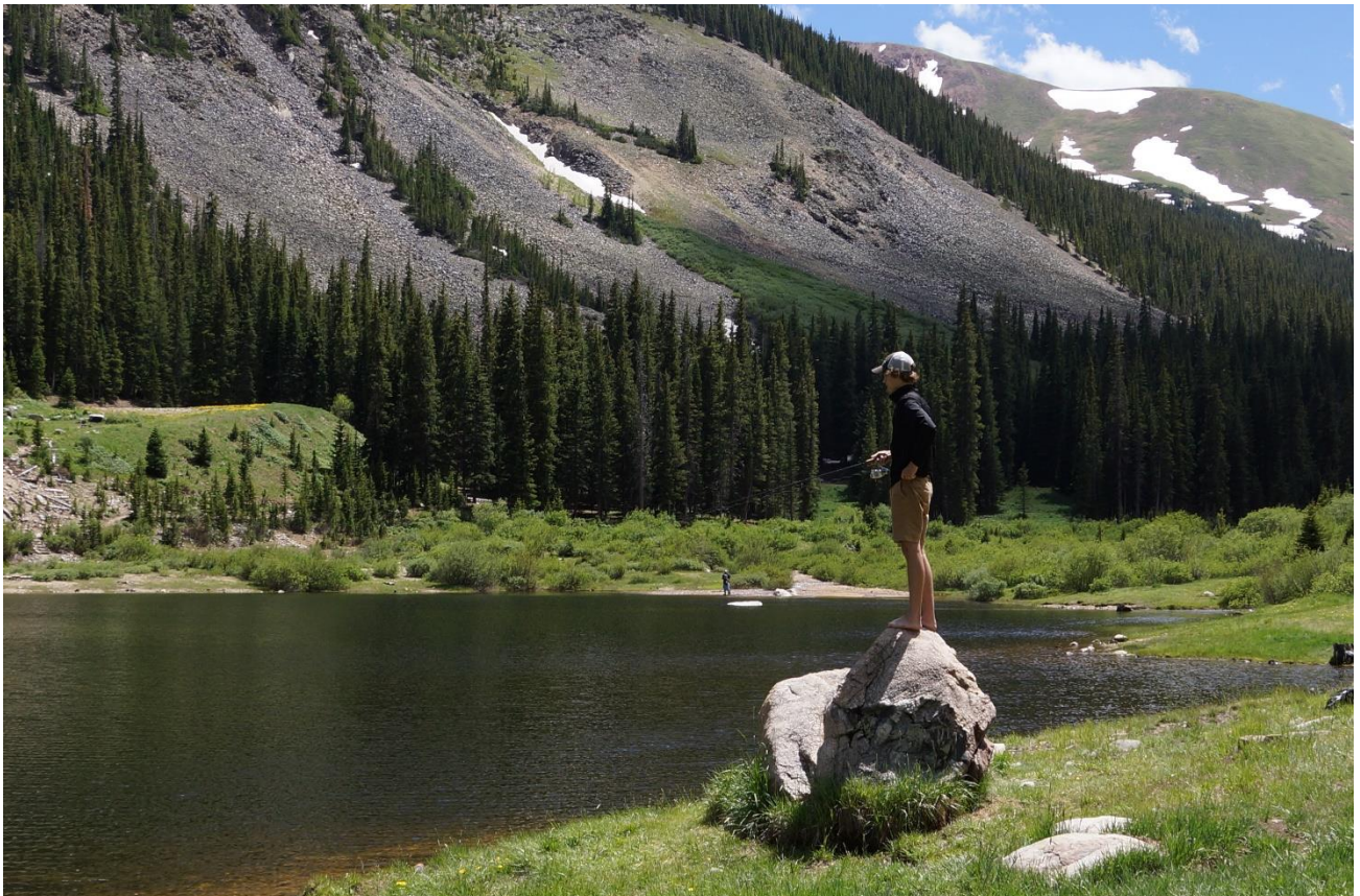
Next adventure was trout fishing at Lake Urad